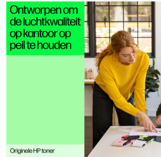
Originele HP toner