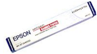
Photo Quality Ink Jet Paper Banner, 41 cm x 15 m, 105g/m 2

Productnaam : Photo Quality Ink Jet Paper Banner, 41 cm x 15 m, 105g/m 2